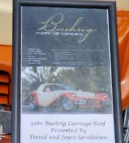
The never before seen 1980 Buehrig