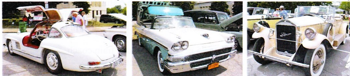
A Gull wing Mercedes: this Ford retractable was a pretty in white & blue;