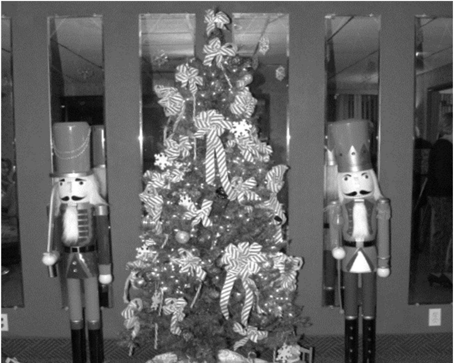
The Polish Falcons was all decked out for the Holidays

OFFICIAL PUBLICATION OF THE LAKE ERIE REGION, AACA