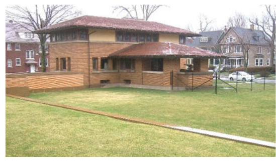
The Barton House

Refreshments will be served after the meeting.