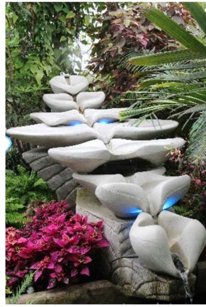
Some of the plants on display including some oriental items. Left: a unique waterfall, below: some very large Koi fish