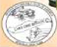
2019 BEST OF SHOW 1947 CADILLAC